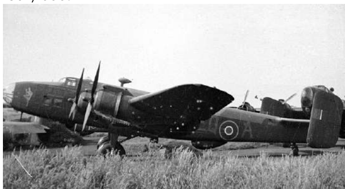
Handley Page Halifax of no 408 SQN RCAF

On the night of January 29-30, 1943, Halifaxes of No. 408 and 419 Squadrons were joined by 40 Vickers Wellington of No. 420, 424, 425, 426, and 427 Squadrons to lead an attack on the harbor infrastructure in Lorient. Explosive bombs as well as incendiary bombs from an altitude between 11,000 and 19,000 feet are planned to be dropped on the target. The "Flak" is important and according to reports the weather is really bad.