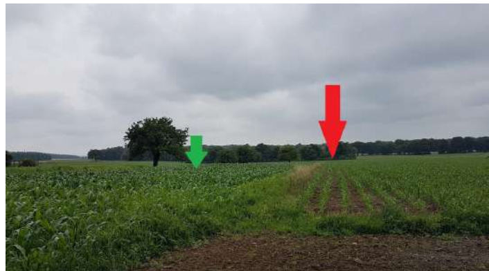
The place where the aircraft crashed on the edge of a small wood (red arrow) and where an engine fell (green arrow)

The aircraft hit the ground quickly after flying over the houses and slid down to the edge of a small wood about 300 meters away. At the time, an engine, which had probably detached, had been found closer, 100 meters from the houses.