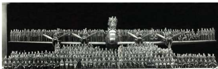
No 408 SQN RCAF in October 1942

and in June 1945 returned its planes to Canada in preparation for the planned invasion of Japan. The unit was eventually disbanded due to the Japanese surrender.